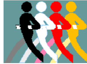
Vacumed ( www.vacumed.com )