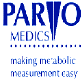
Parvo Medics, Inc. ( www.parvo.com )