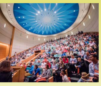
Education Provide highest quality and value education when, where and how stakeholders want it.

Create high value member experiences in order to drive loyalty with existing members and recruit new members.